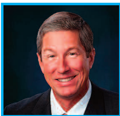
Mayor (Incumbent) Rex Hardin